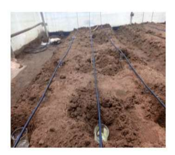
Figure 4: Flow measurement of emitter discharge at pressure head of 1.5 m